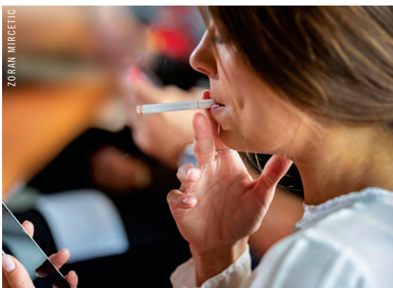
A diver's overall health as well as exposure to CO outside of diving, such as with smoking, can change their risk level for CO toxicity.

your charged cylinder are either 5 ppm or 10 ppm. 7,8 Both levels would be safe when considered for a dive time of